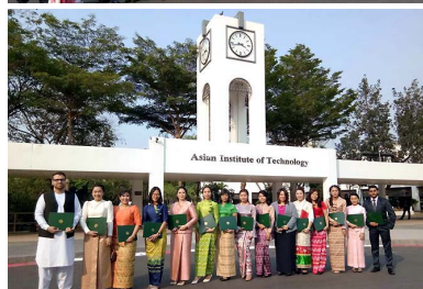
Recipients of the HM King's Scholarships (top), HM Queen's Scholarships and Loom Nam Khong Pijai (GMS) Scholarships pose at AIT Clock Tower