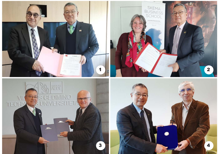
Agreement signing with 1. Emlyon Business School, 2. Skema Business School, 3. Vilnius Gediminas Technical University and 4. University Politehnica of Bucharest.

The AIT president found receptive senior-level ears to his new positioning message of "Social Impact with Innovation." European university leaders expressed collective inter-