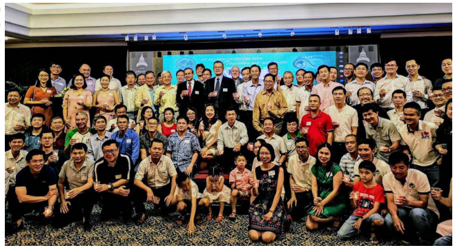
60th Anniversary Gala Dinner organized by AIT Alumni Association Viet Nam at Ho Chi Minh City.

logo will be on our AIT literature and significant programs during 2019.