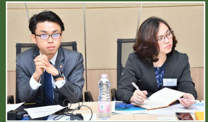
Horizontal Learning Event on Establishing Standards for Performance Test for Decentralised Wastewater Treatments 3 September