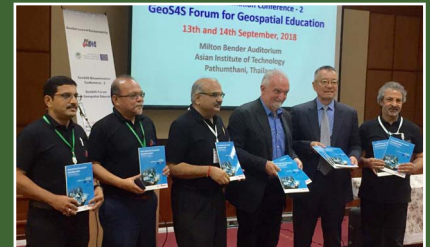
GeoServices-4-Sustainability (GeoS4S) Forum for Geospatial Education 13-14 September