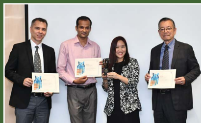
Elsevier Atlas Award For December 2017