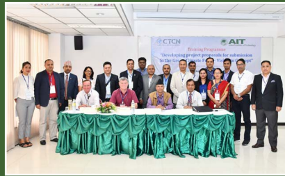
Training on Developing Project Proposals for Submission to the Green Climate Fund-Vision to Concept 3 September