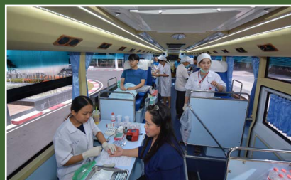
Blood Donation Camp 5 September