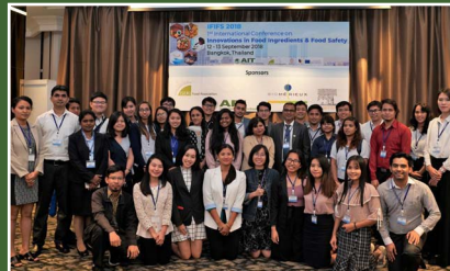
Conference on Innovations in Food Ingredients and Food Safety 12-13 September