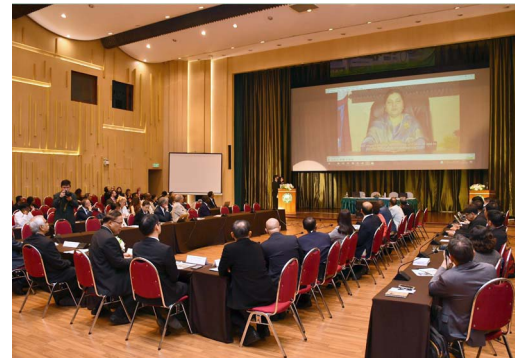
President of Nepal delivering a video message for the Conference.

Felicitation messages were delivered by H.E. Bidya Devi Bhandari, President of the Republic of Nepal, and H.E. Mr. Malik Amin Aslam Khan, Adviser to the Prime Minister on Climate Change, Pakistan. Two days of deliberations was followed by a field trip to the Khao Yai National Park, which was organized by the Department of National Parks, Wildlife and Plant Conservation.